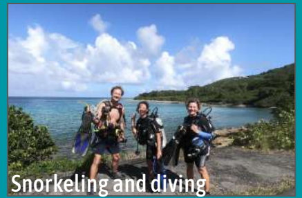
Snorkeling and diving