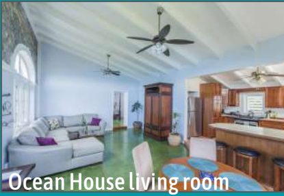
Ocean House living room