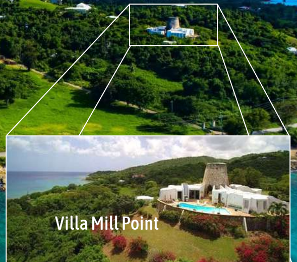
Villa Mill Point

6 bedrooms surrounding a historic sugar mill Pool with panoramic views Spacious kitchen and dining area